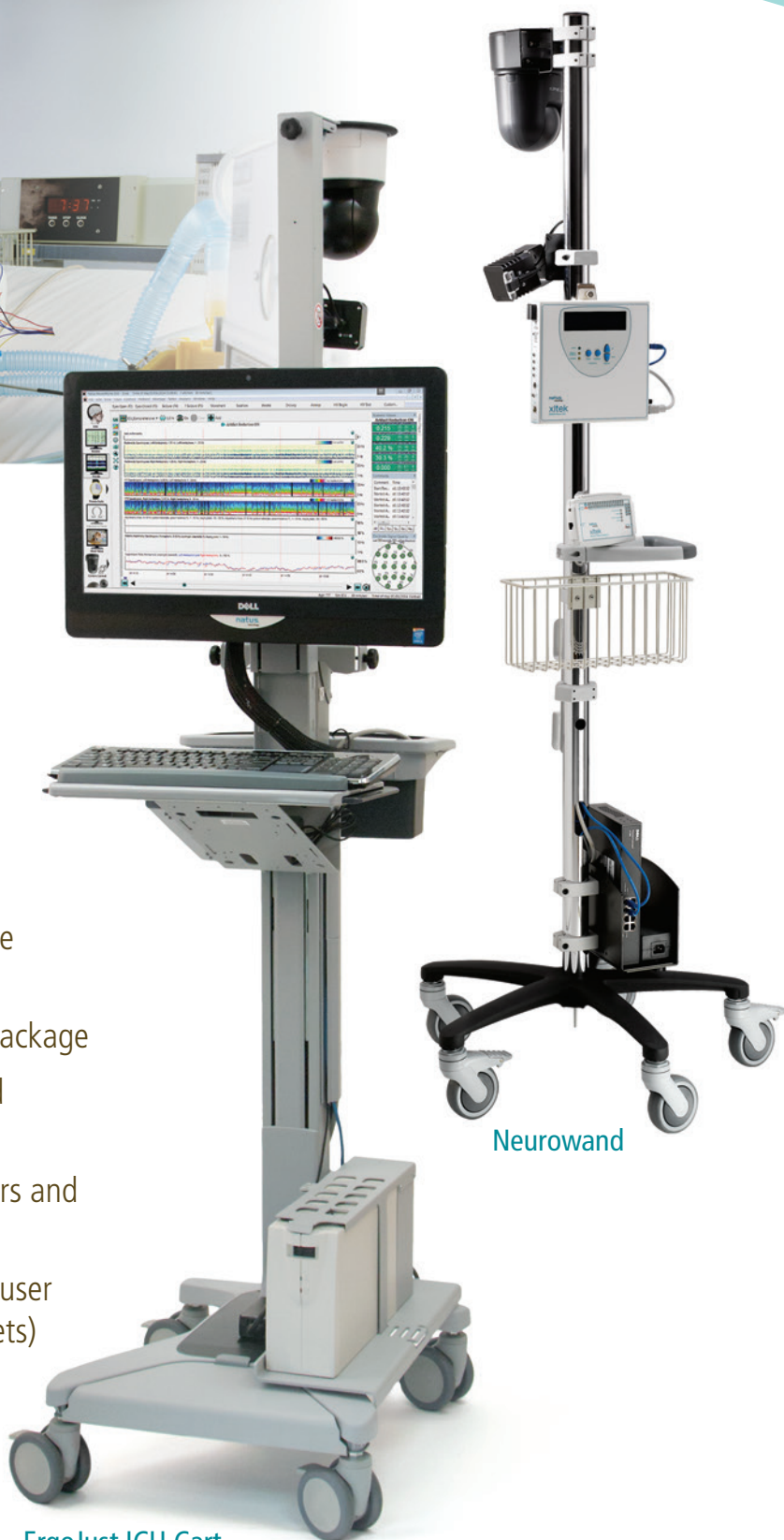
ErgoJust ICU Cart

Performance: Event detection and trending with user configurable notifications (available in select markets)